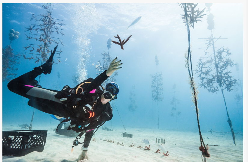
Immerse yourself in a world of hope for coral reefs this World Oceans Day.