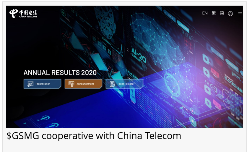
$GSMG cooperative with China Telecom

Glory Star New Media Group Holdings Limited (GSMG) is a leading mobile entertainment operator in China. The GSMG ability to integrate premium lifestyle content, including short videos, online variety shows, online dramas, live streaming, its Cheers lifestyle video series, e-Mall, and mobile app, along with innovative e-commerce offerings on its platform enables it to pursue its mission of enriching people's lives. The GSMG large and active user base creates valuable engagement opportunities with consumers and enhances platform stickiness with thousands of domestic and international brands.