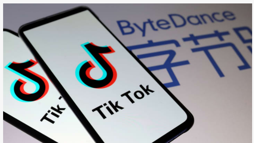
$GSMG cooperative with ByteDance (Tik Tok)

Operating margin was 24.8% for the full year of 2020, compared to 40.8% for the full year of 2019.