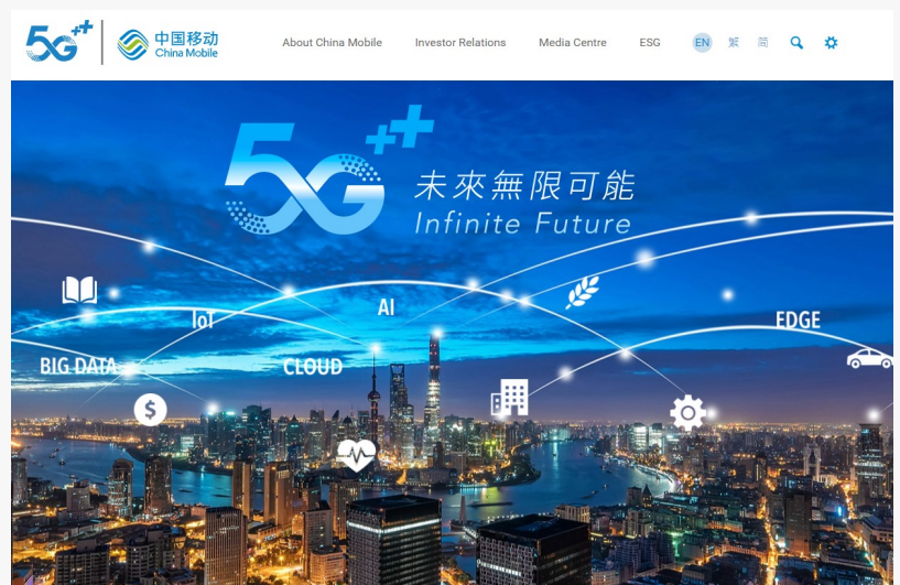
$GSMG cooperative with China Mobile