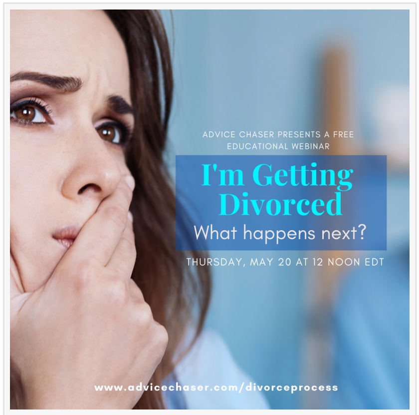
Info on Advice Chaser's free educational webinar on divorce finances

NEW YORK CITY, NEW YORK, UNITED STATES, May 18, 2021 /EINPresswire.com/ -- Divorce is a difficult process—even under the best of circumstances. The physical and emotional turmoil of separating a household can be so overwhelming that financial concerns get less attention than they deserve. It's important to understand that the way the settlement shakes out can impact your independence for the rest of your life. If you're getting divorced, join our new Advice Chaser webinar on May 20 at 12:00 noon Eastern time. You'll learn about what your financial options are and how to start your new life on a