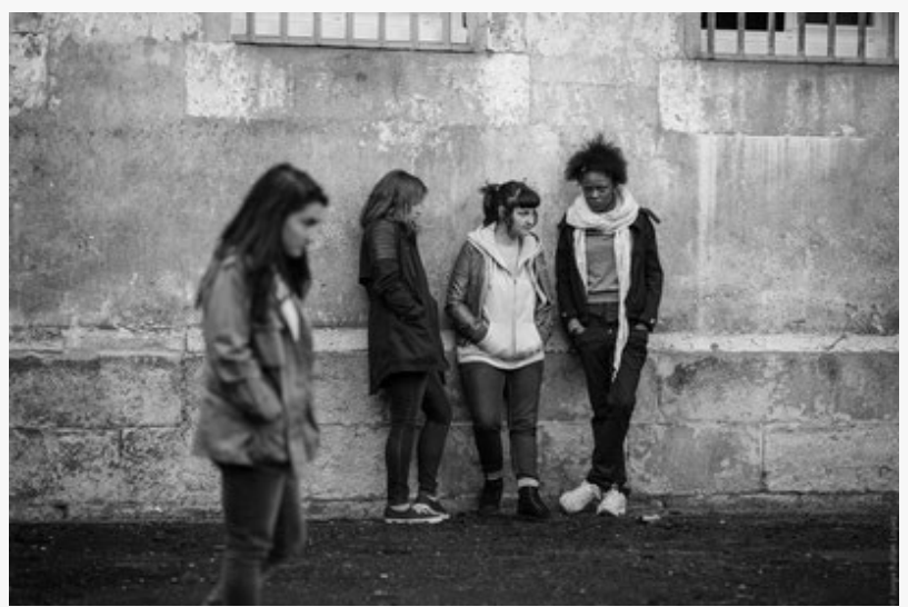
Behind Your Skin