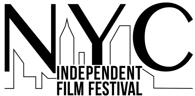
Logo NYC Independent Film Festival