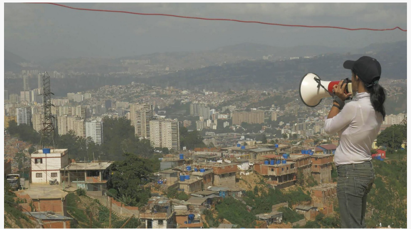
Chronicle of the Stolen Land