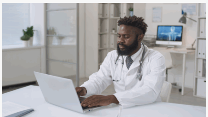
Lifemesh Clinic-as-a-Service, Complete Digital Health