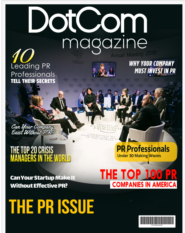
The DotCom Magazine Entrepreneur Spotlight Show