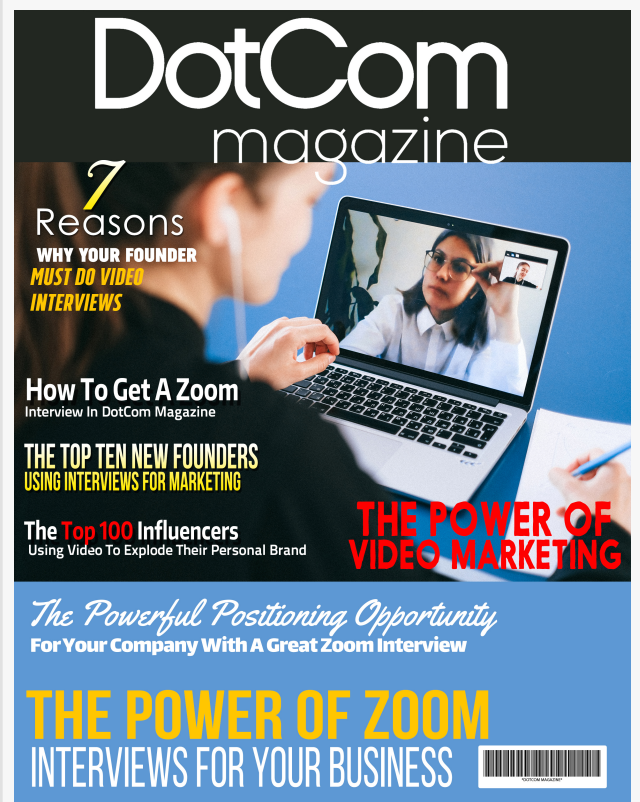
The DotCom Magazine Exclusive Zoom Interview