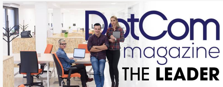
The DotCom Magazine Entrepreneur Spotlight Series