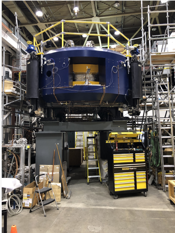
Best 70 MeV Cyclotron Magnet Assembly

IBS provided some of the Critical Components Specifications, 16 months late, and as a result, we requested a delay in the delivering of the cyclotron. I wrote in June 2018 to PPS, copied to IBS, and requested that PPS amend the contract, and gave them 30 days to respond. PPS responded to us six months later, in January 2019, stating that they will not amend the contract.