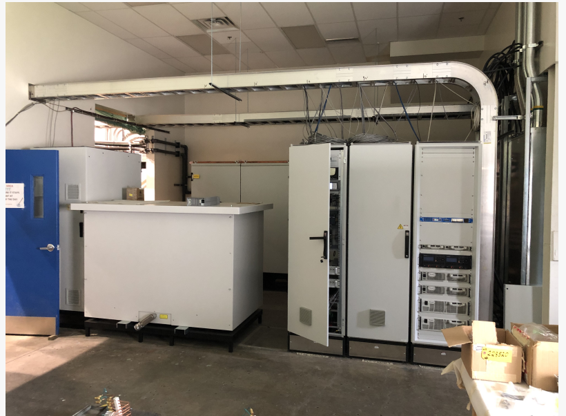
Best 70 MeV Cyclotron Cabinets

IBS provided some of the Critical Components Specifications, 16 months late, and as a result, we requested a delay in the delivering of the cyclotron. I wrote in June 2018 to PPS, copied to IBS, and requested that PPS amend the contract, and gave them 30 days to respond. PPS responded to us six months later, in January 2019, stating that they will not amend the contract.