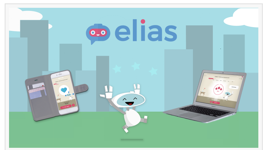
Elias Robot, empowering language education with robots. Available for desktop and mobile devices.

HELSINKI, FINLAND, May 21, 2021 /EINPresswire.com/ -- Starting last November 2020, IMPACT EdTech Remote Schooling program united European start-ups, mentors, and participant schools for a common goal, to improve the Educational Technology solutions during and after the Covid-19 pandemic.