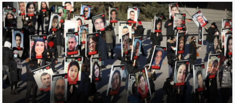
Family members of the deceased and many other protesters took to the streets demanding that the regime leaders be accountable for the shooting down of the airliner.