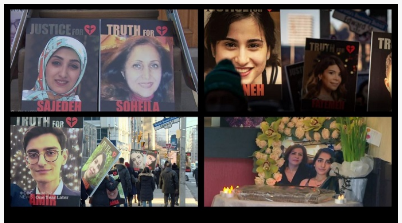
the never-ending grief of the victims’ families.