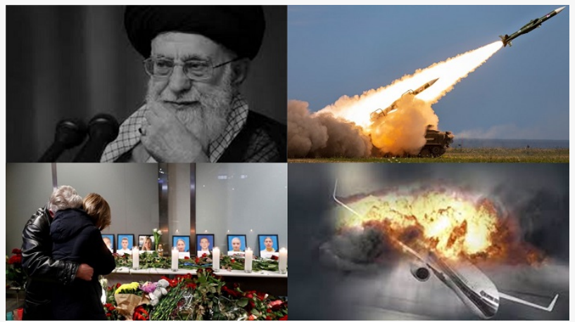
A Ukrainian airliner was shut down by the Iranian regime on Jan 8, 2020, killing 176 people on board.