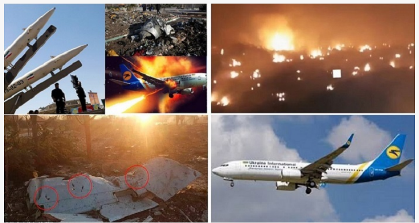
Iranian regime fired missiles on a civilian airplane killing 176 innocent people.