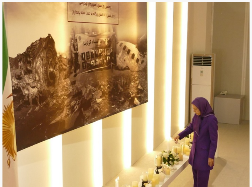
Maryam Rajavi welcomes Ontario's Court ruling on the downing of Ukrainian Airlines flight PS752, emphasizes need to blacklist IRGC

On May 21, 2021. the Superior Court of Ontario, Canada, ruled that the downing of the Ukrainian Airlines flight PS752 by the Revolutionary Guards (IRGC) was a deliberate act of terrorism.