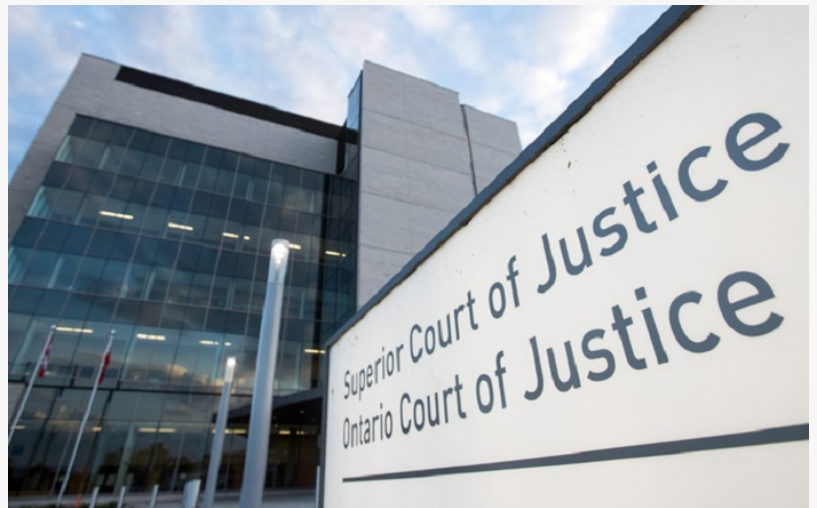
The Superior Court of Ontario, Canada.