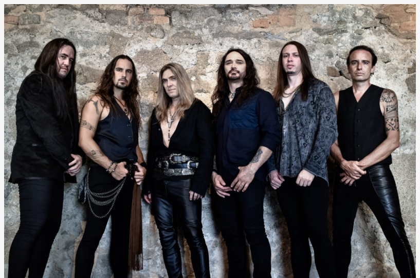
New photo of the brazilian power metal band

"Today is a very special day. Not only for completing almost half a century of life, but mainly for being able to celebrate 30 years of career with a special album and that makes a real rescue of my whole journey. A way to thank the fans for all that care and support over the years. The birthday is mine, but the gift is for the fans", said