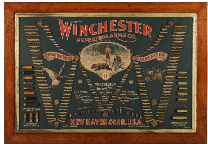
Winchester 1887 cartridge display board, American, among the most highly sought and iconic American sporting advertising cartridge boards (est. CA$20,000-$25,000).

Don's collection of sporting advertising includes numerous posters advertising products from