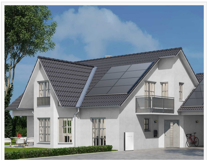
Solar Installation Reduces Energy Costs

Purchases and Refinancing create an opportunity to improve the comfort and increase the value of the home. By increasing the mortgage to cover energy improvement costs, the monthly payment will be more, but the homeowner will save money by lowering the cost of energy. Learn more at greenmortgageadvantage.com