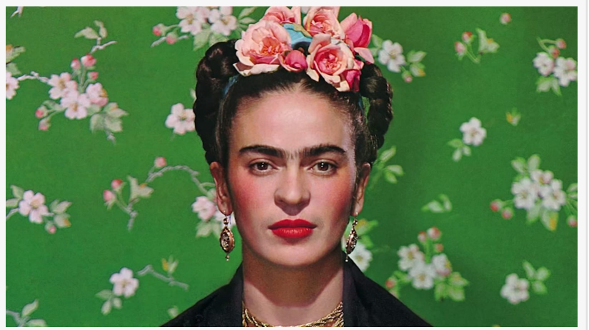
Out of sight, out of mind