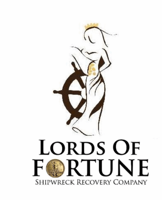
Lords Of Fortune

Many treasure books had reported on Republic's treasure, but not one provided any detail. Why