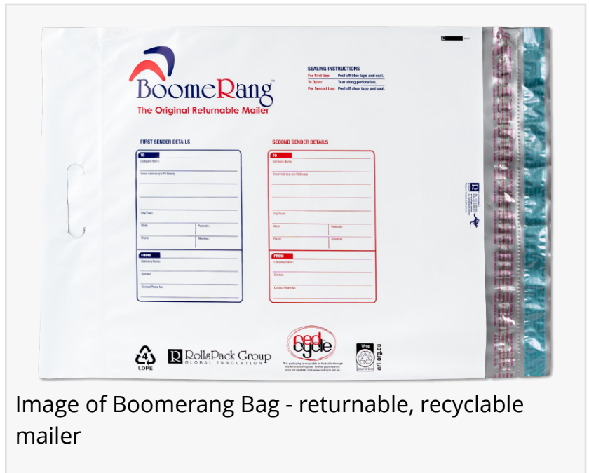
Image of Boomerang Bag - returnable, recyclable mailer

RollsPack is thrilled to be a part of the REDcycle program , which seeks to recover and recycle plastics that would otherwise wind up in landfills. Once recovered from manufacturers, merchants, and customers who are working with us and REDcycle on this effort, they are turned into long-lasting, splitter-resistant items that are termite resistant. These recycled materials are used to make a variety of playgrounds and surfaces.