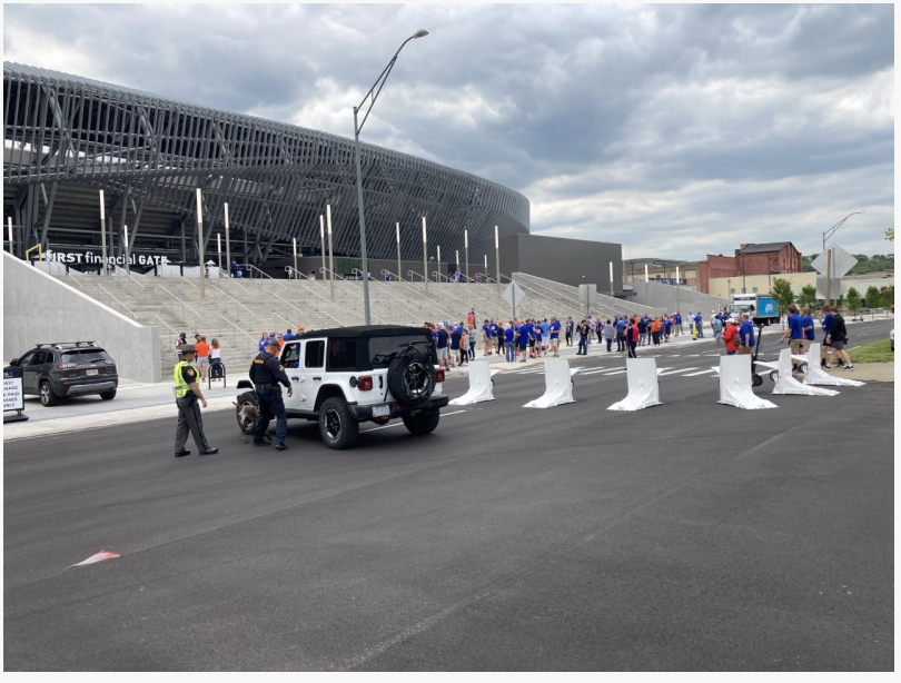
Pedestrian/fan safe zone at new FC Cincinnati stadium.