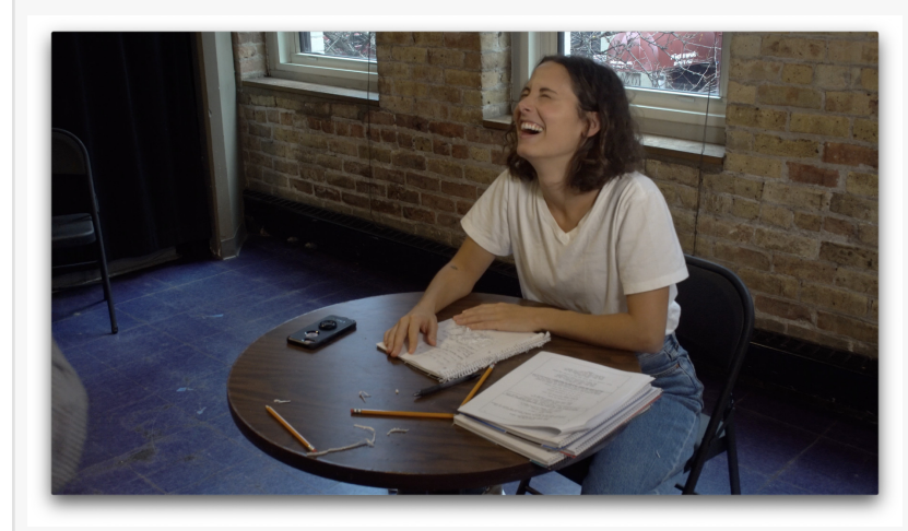
By The Time You Read This