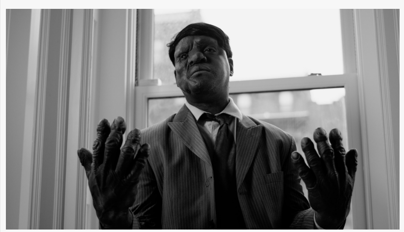
The Henchman of Notre Dame

inflatable sex doll. The doll has feelings for him too. So when a real woman appears in the man's life, it upsets the doll.