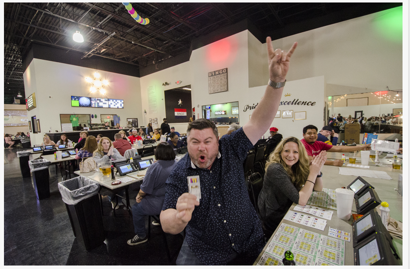
Pull Tabs Winner at Triple Crown Bingo in Houston, Texas

Can't wait for the new bingo hall to open? Visit the original location at 10535 Jones Road #200 in Houston, TX 77065.