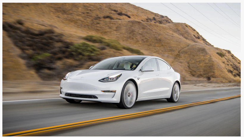
Rent A Tesla