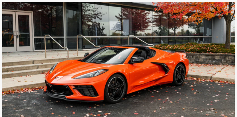
Rent The New Corvette C8

Safety and protection are a top priority at Eligo, which is why they have $2 million liability