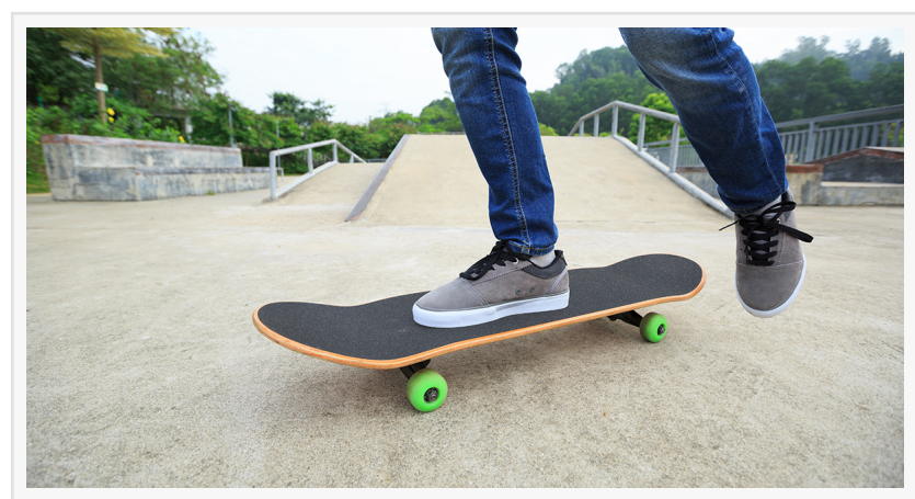
Ride the griptape with a purpose - Jessup's ULTRA NBD

MCHENRY, IL, UNITED STATES, May 26, 2021 /EINPresswire.com/ -- Jessup Manufacturing Company, the global leader in the skateboard griptape market, today announced the limited release of ULTRA NBD, the world's first griptape made with Nike Grind, recycled rubber scrap from Nike's footwear manufacturing.