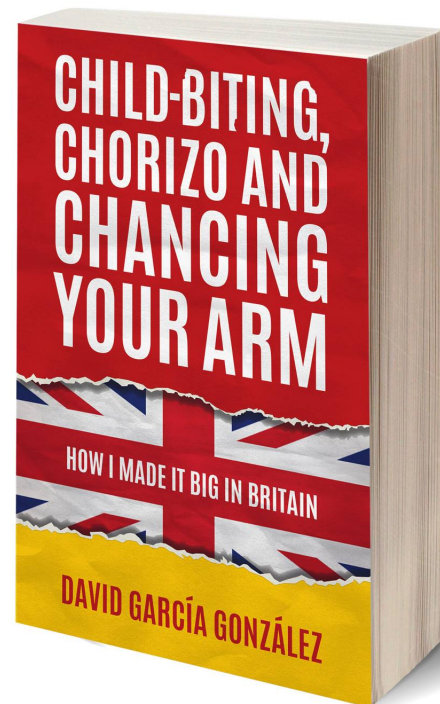
Child-Biting, Chorizo, and Chancing Your Arm

MIAMI, FLORIDA, UNITED STATES, May 27, 2021 /EINPresswire.com/ -- As the world begins to take its first steps into normalcy after a global pandemic that changed the face of the social and economic landscape, millions are turning to seasoned experts for guidance in navigating a post-pandemic world. Millions of Americans have lost businesses, been left jobless, and are wondering what it takes to succeed in this new normal. One man's story of triumph against all odds is inspiring a new generation of entrepreneurs to strive for greatness, regardless of circumstance, and rise above the challenges for the greater good.