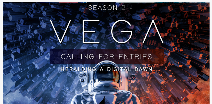
2021 Vega Digital Awards Season 2: Call for Entries