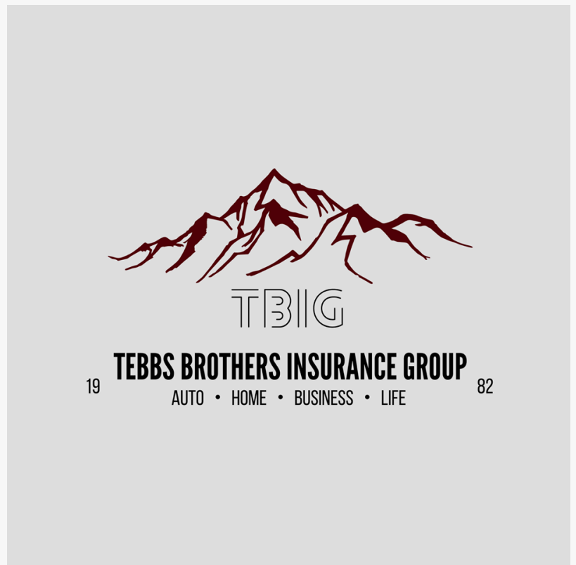
801-278-8881 Tebbs Brothers: #1 Home LIFE Auto