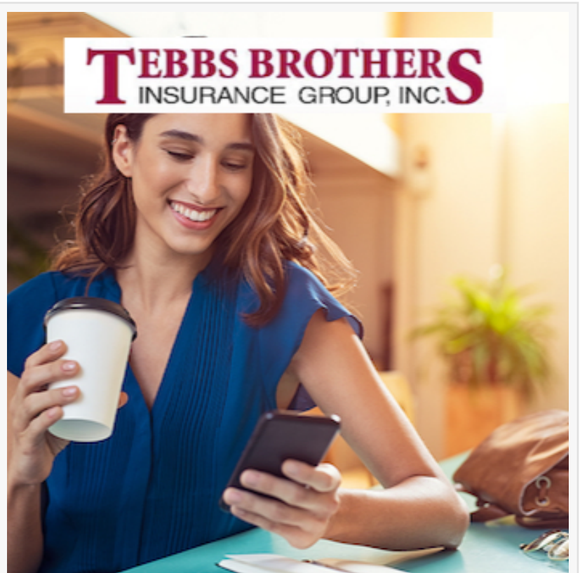
TEBBS Bros: UTAH's #1 BUSINESS Home Life Auto INS

Since policies vary with protection options, it's important to talk to a specialist at Tebbs Brothers Insurance Group, Inc. to create a policy that insures your needs. If one is involved in an accident