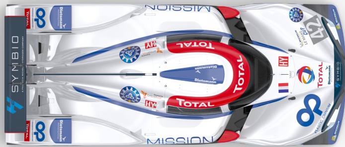
Top view of the MissionH24 race car