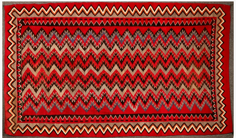
Beautiful, circa 1880-1920 Red Mesa Navajo rug, a gorgeous example, 5 feet by 8 feet 5 inches and only recently professionally cleaned and restored ($5,000).