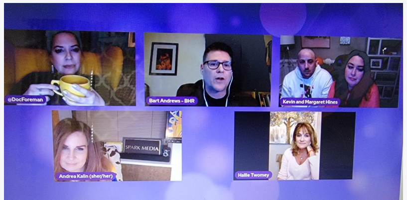
It's Complicated Livestream panel Jan. 22, 2021