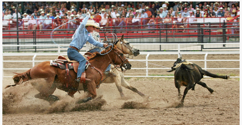
8 Flat at Cheyenne