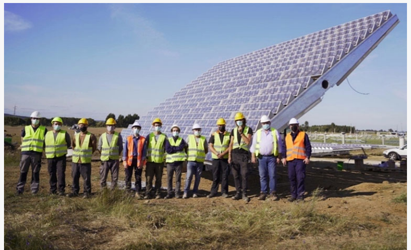
CCC Partners with Fusion Fuel