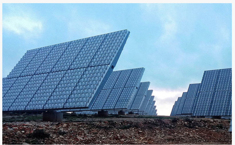
Green Hydrogen Demonstrator Plants

HEVO-SOLAR is the exciting result of the combination of over a hundred of Fusion Fuel's revolutionary HEVO electrolyzers with a specially-designed high efficiency concentrated photovoltaic (CPV) solar module, a solution designed to make optimal use of both the electrical and thermal energy from the sun.