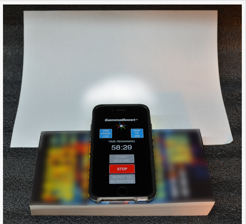
GammaBoost Reflected on Paper