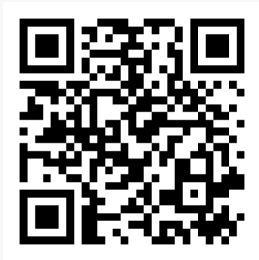
GammaBoost QR Code

This press release can be viewed online at: https://www.einpresswire.com/article/542275625