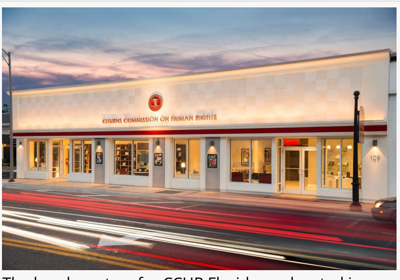
The headquarters for CCHR Florida are located in downtown Clearwater.

CLEARWATER, FLORIDA, UNITED STATES, May 27, 2021 /EINPresswire.com/ -- Since 1949 May has been observed as Mental Health Month for the stated purpose of educating people on mental health issues, prompting the Florida chapter of <u>CCHR</u> to host an open house for the purpose of educating the general public on the dangers associated with psychiatric drugs.