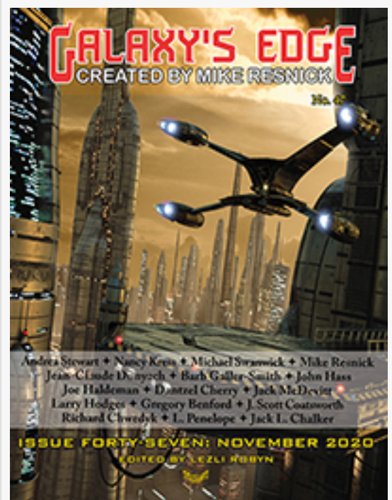
Galaxy's Edge Magazine