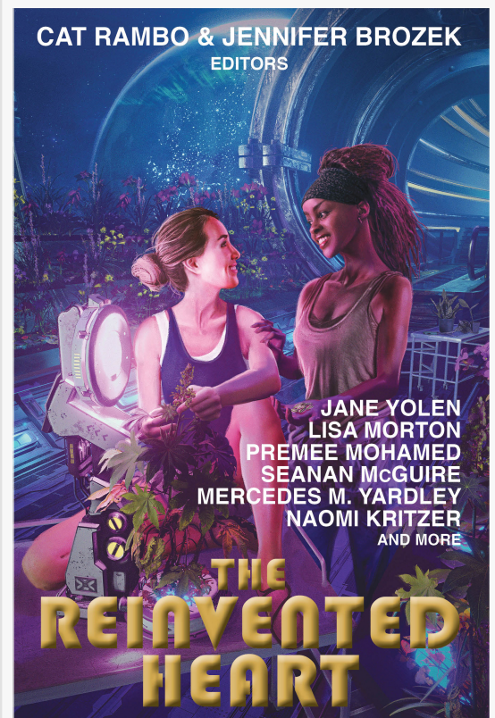
THE REINVENTED HEART

This press release can be viewed online at: https://www.einpresswire.com/article/542276909 EIN Presswire's priority is source transparency. We do not allow opaque clients, and our editors try to be careful about weeding out false and misleading content. As a user, if you see something