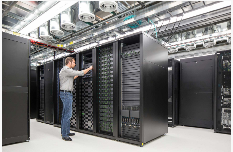
Backup Tech US Business IT Services