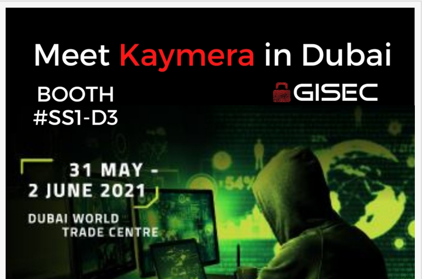
Visit Kaymera's booth in GISEC 2021

CIOs and CISOs - e the decision makers in adopting organization-wide security solutions and