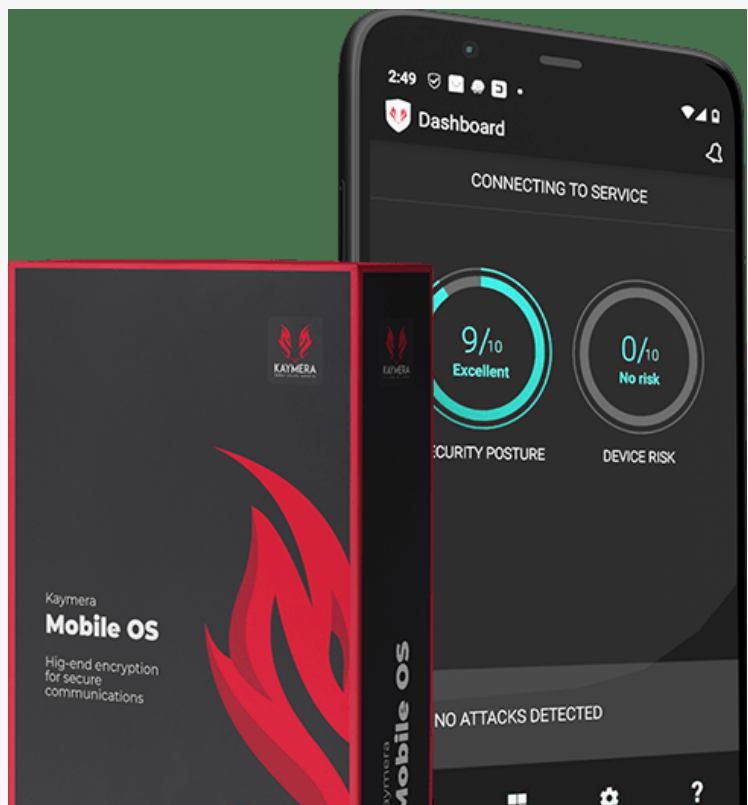
The only mobile security you need