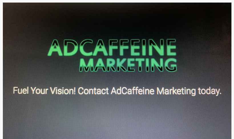
seo company south fl

Did you know that Google Maps optimization is a highly competitive platform, where many business owners strive to be listed for certain keywords within the top 3 results? Typically, Google rewards only the businesses that have properly optimized the listings. If you don't know what targets to hit when setting up a Google Maps listing, you may never be seen by your customers! This is why Local Google My Business SEO is a huge deal.