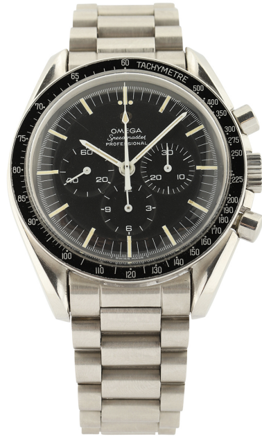
Rare Omega Speedmaster Pre-Moon watch from 1968, Reference 145.022-68, utilizing cal. 861, with correct applied Omega logo and indices (est. CA$14,000-$16,000)

This press release can be viewed online at: https://www.einpresswire.com/article/542391140 EIN Presswire's priority is source transparency. We do not allow opaque clients, and our editors try to be careful about weeding out false and misleading content. As a user, if you see something we have missed, please do bring it to our attention. Your help is welcome. EIN Presswire, Everyone's Internet News Presswire™, tries to define some of the boundaries that are reasonable in today's world. Please see our Editorial Guidelines for more information. © 1995-2021 IPD Group, Inc. All Right Reserved.