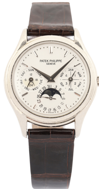
Patek Philippe Reference 3940 perpetual calendar men's watch with 18kt white gold case and clasp, originally purchased in 1999 from Tourneau (N.Y.) (est. CA$35,000-$45,000).