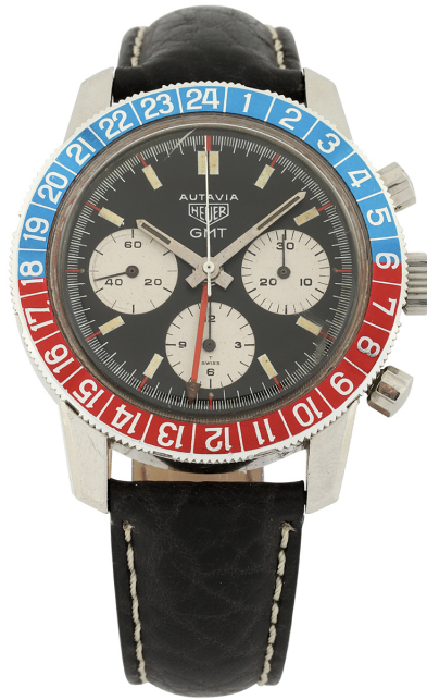
Tag Heuer Autavia GMT 2446C watch from 1972 featuring an amazing Pepsi bezel (the color of which still pops) and original pushers and crown (est. CA$18,000-$20,000).