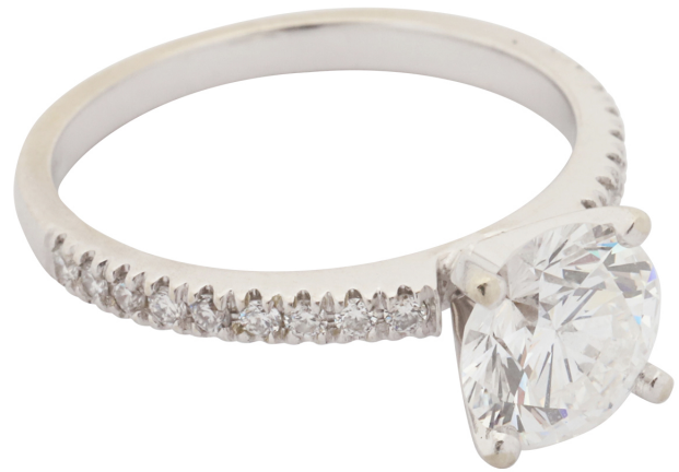
Dazzling diamond solitaire ring with 1.99-carat center stone, 14kt white gold band, a fabulous investment-grade natural diamond, F color, VS2 clarity (est. CA$18,000-$20,000).

A Patek Philippe Reference 3611/1 Calavatra watch made in 1975 with case and bracelet both solid 18kt yellow gold, the timeless design inspired by the minimalist principles of the Bauhaus School, is expected to bring $16,000-$18,000; while a Tag Heuer Autavia GMT 2446C watch from 1972 featuring an amazing Pepsi bezel (the color of which still pops), original pushers and crown, plus compressor case, should go for $18,000-$20,000.