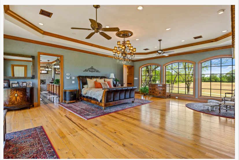
Additionally, the combination of wooded and agricultural lands would work well for offsetting a company's carbon footprint while enjoying as a corporate retreat or the hunting business aspect of the property.