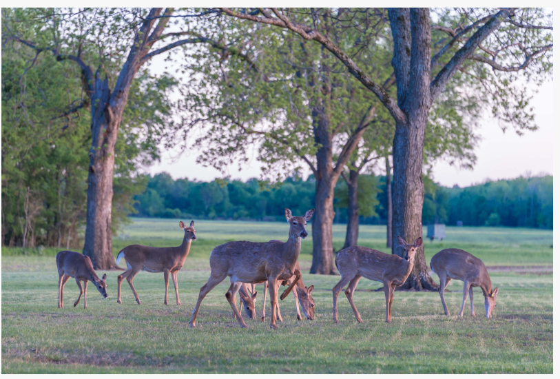
The gorgeous swath of acreage contains 25 quality blinds with 15 feeders, accessed by endless trails and abundant lanes.

Natural creeks, carefully designed interior road system, and miles of trails and lanes wind to all corners of the property, safe within seven miles of high fence that keep its top-tier whitetail population safe (and predators and wild pigs out).