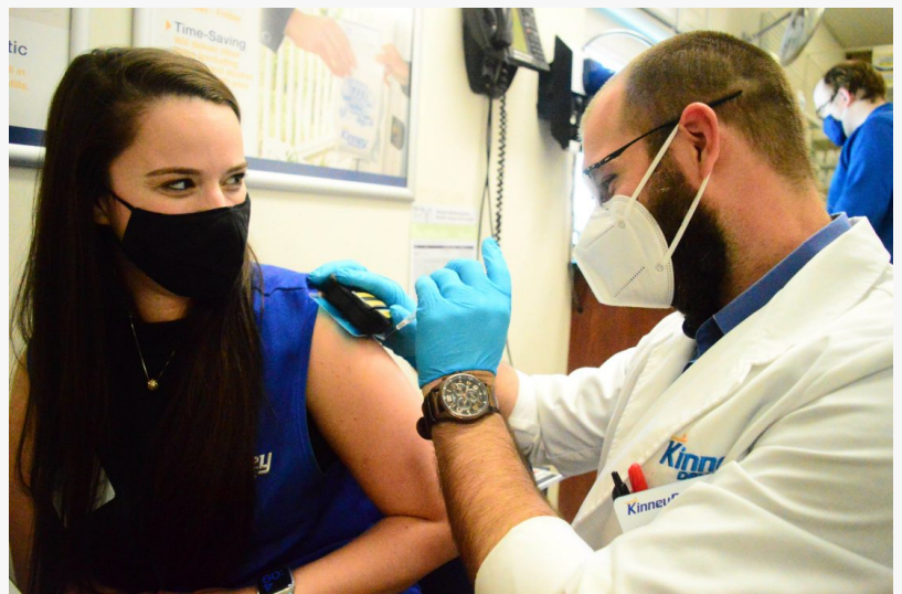
Kinney Drugs Employee Gets COVID Vaccine with Buzzy