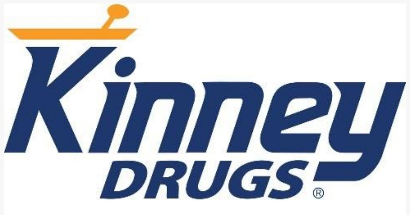
Kinney Drugs Logo