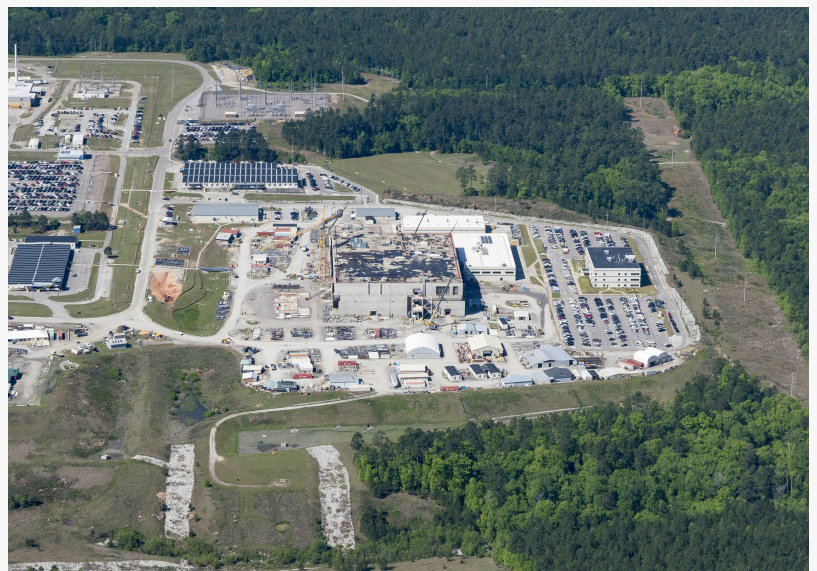
Partially finished Mixed Oxide Fuel Fabrication Facility (MFFF) at DOE's Savannah River Site in South Carolina; Boosters want to convert the MOX plant to the SRS Plutonium Bomb Plant (PBP)

Given DOE’s extremely poor track record in managing complex and costly construction projects, as was seen with the MOX debacle, it is fully expected that the pit plant cost will increase over time and that the schedule for the project will continue to slip. The high cost of the SRS pit plant construction and operation will put extreme pressure on both the pit project and the new W87-1 nuclear warhead - atop the new, proposed Ground Based Strategic Deterrent missile - for which the first pits would be made, according to SRS Watch.