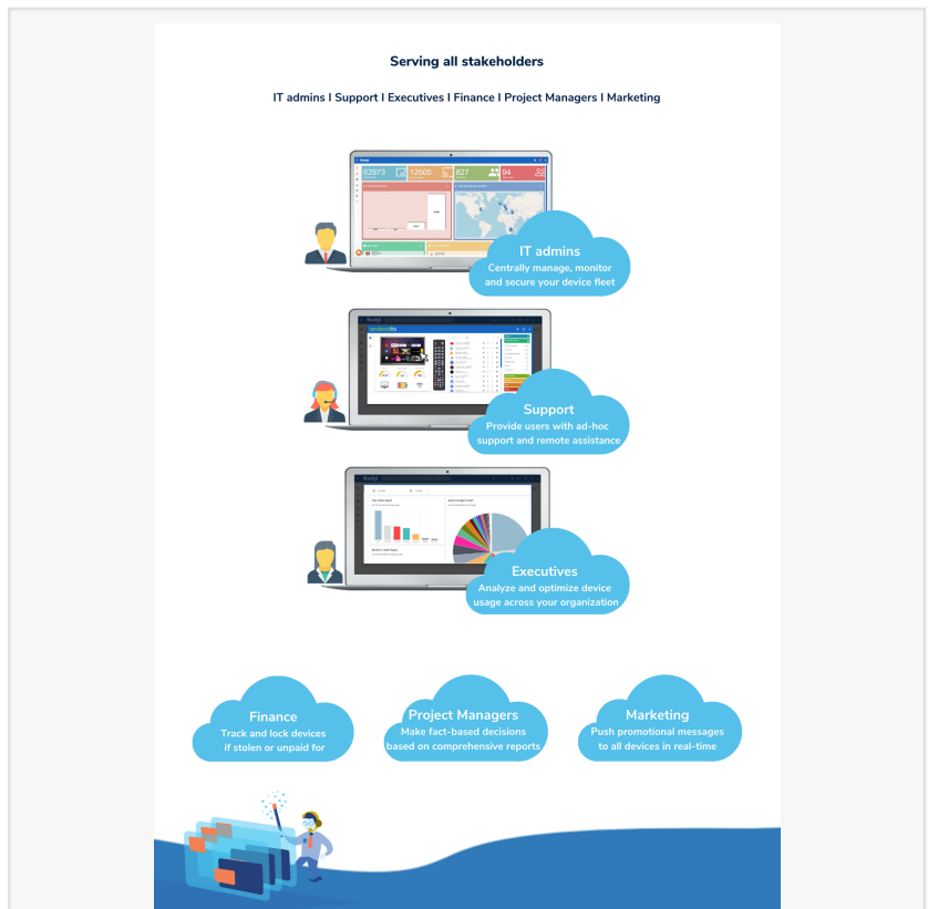
Radix Android TV Manager - one management platform serving all stakeholders