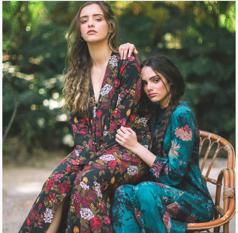
Shop Curated Collections based off of Your Personal Style Trends Like this Cottage -Core Collection

The Los Angeles-based company built its website focusing primarily on the customer's shopping experience rather than a business or inventory perspective. This user-oriented design created an