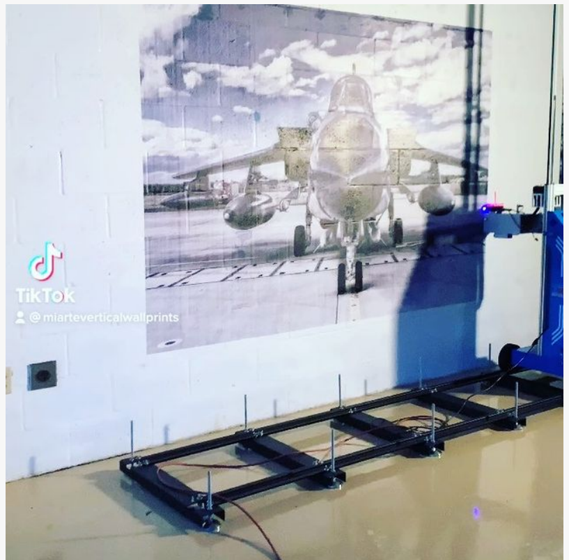
MiArte sets up The Wall Printer