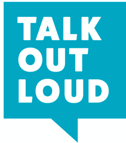
Talk Out Loud Logo