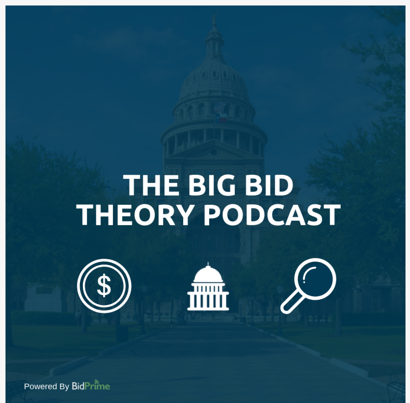
'The Big Bid Theory' logo

"We would do better if we were investing more continuously, at a higher level than we are now, rather than dealing with these issues as crises.", Schofer suggests one approach decision makers can take in addressing problems in U.S. infrastructure.