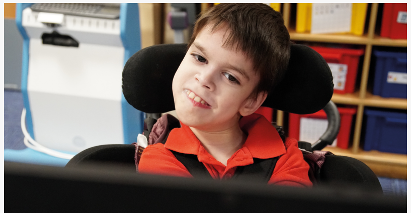
Skyle for Windows Designed for Learners of all Abilities