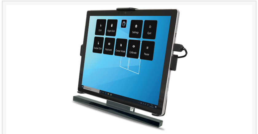
Skyle for Windows with Surface Pro

Indiscriminate of skill, it is perfect for multi-user settings. It allows anyone to start at any level of ability and build their gaze control skills at their own pace. Simply plug in Skyle for Windows