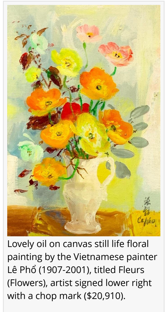
Lovely oil on canvas still life floral painting by the Vietnamese painter Lê Phổ (1907-2001), titled Fleurs (Flowers), artist signed lower right with a chop mark ($20,910).