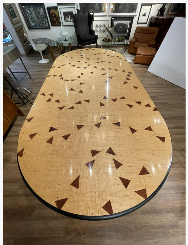
Dining table designed by Wendell Castle (American, 1932-2018), inlaid with purpleheart triangles and inlaid dots spelling "The Check's in the Mail", the table's title ($70,110).

Mr. Castle created a similar table for his own residence titled Never Complain, Never Explain, in 1981. It's pictured on the cover of the book Furniture by Wendell Castle (Hudson Hills Press, NY, 1989). The Check's in the Mail (1988) was 120 inches long and 59 inches wide and signed and