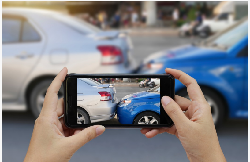
Taking photos after a car accident