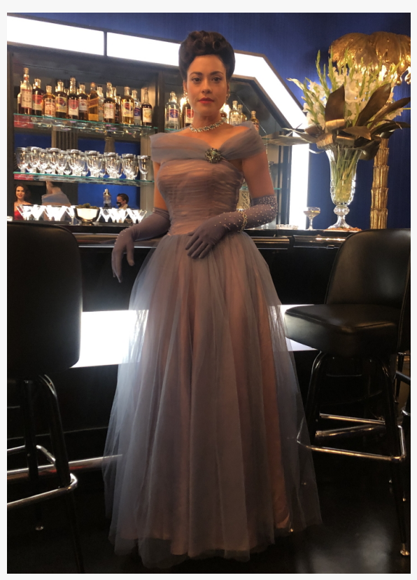
Cynthia Quiles recurs as 'Brenda' in Season 2 of Marc Cherry anthology 'WHY WOMEN KILL' on Paramount+

This press release can be viewed online at: https://www.einpresswire.com/article/542810885