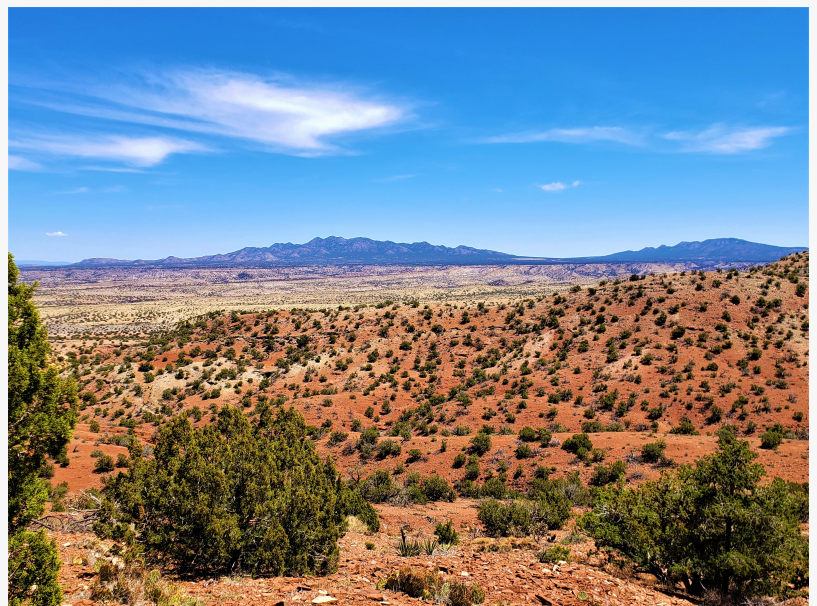
Diamond Tail - Placitas, New Mexico

Antoine Predock is revered as one of the top architects of all time, whose work has been featured in over 60 exhibitions, 250 books, and more than 1,000 publications. His first solo project the La Luz townhome community in Albuquerque, NM, garnered national attention, praise, and buyers from all over the world. His impressive career boasts some of the world's most recognizable structures, including the "Venice House" in Southern California; Petco Park stadium in San Diego; the Turtle Creek House, for bird enthusiasts in Texas; a lakefront "gateway" center for a new community in Chengdu, China; and the Museum for Human Rights in Winnipeg, Canada, which is featured on the Canadian ten-dollar bill.