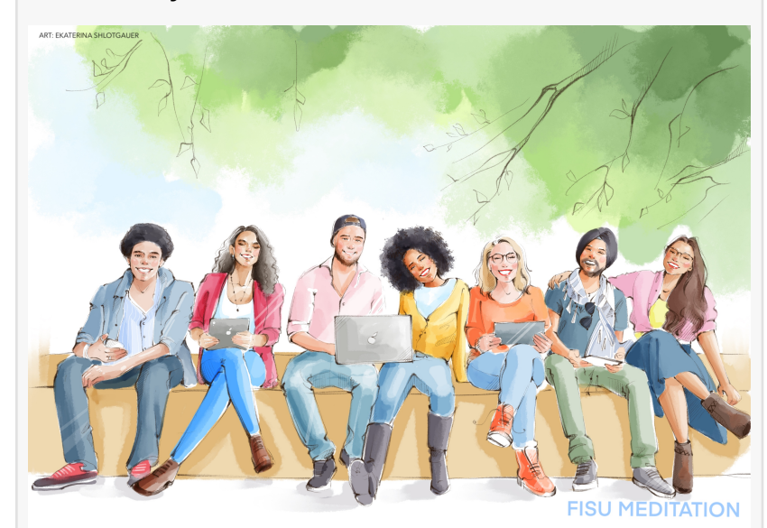
FISU Meditation Courses for the LGBTQ+ Community - No Barriers!